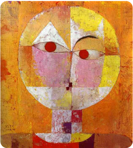
This painting, by Paul Klee, is called Senecio (Old Man) . The shape and colour of the face have been distorted, but it is still recognisable as a face.

In the art world, the term distortion is used to describe any change made by an artist to the shape, size or visual character of a form to express an idea, convey a feeling or enhance visual impact.