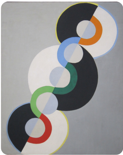
This painting, by Robert Delaunay, is called Endless Rhythm . It represents the movement of music through endlessly connected circles and loops.

Orphism was an abstract painting style developed by married artists Robert and Sonia Delaunay around 1912. It was based on Cubism but pioneered a new emphasis on bright colours and abstract shapes to create energy and movement.