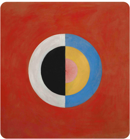
This painting, by Hilma af Klint, is called The Swan No. 17 . The subject matter has been reduced to pure shape and colour. Without knowing the title of the piece, the viewer would not know that the painting represents a swan.

Abstract art takes recognisable objects or forms and changes them until they no longer look realistic. Abstract art allows artists to freely communicate their ideas in a way that is not limited by reality. The artist may leave out details, change the point of view, exaggerate the size, distort the shapes and colours or twist and simplify forms.