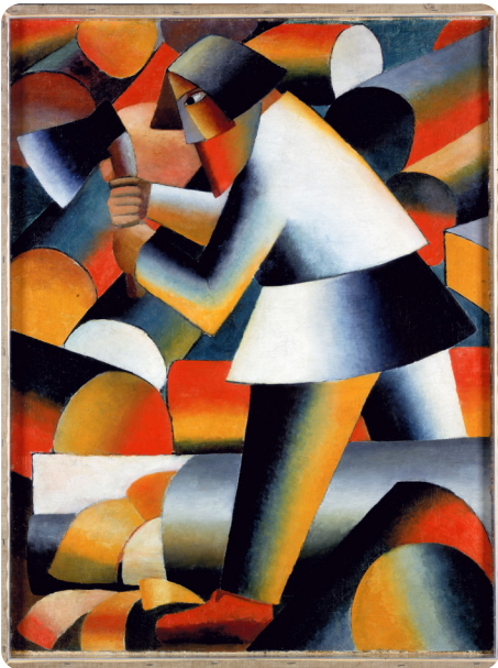
Some artworks reduce their subject matter to basic shapes, such as The Woodcutter by Kazimir Malevich.