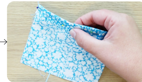
Use a needle and thread to sew running stitches along the hem.