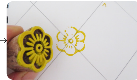
Press the block onto a piece of paper or fabric.