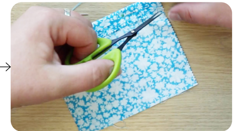
Tie a knot at the end of the hem and cut the thread. Iron along the crease to flatten the hem.