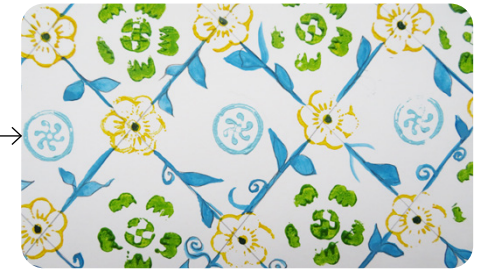
Repeat with other blocks and colours until the pattern is complete.