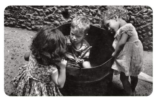
Naples, Italy – Children, 1961