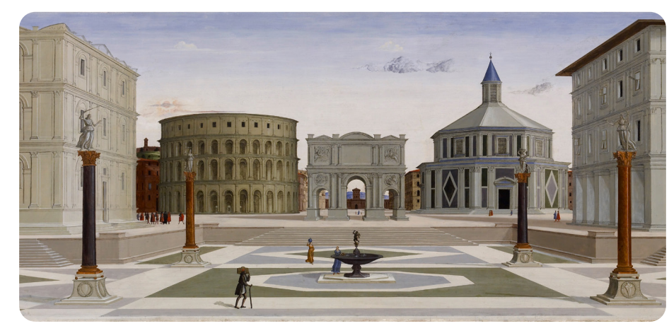
The Ideal City by Fra Carnevale, c1480–1484

Urban landscapes are drawings of towns and cities shaped by the people and buildings found there. Different atmospheres are created using bright, dark or muted colours and sharp or blurry lines.