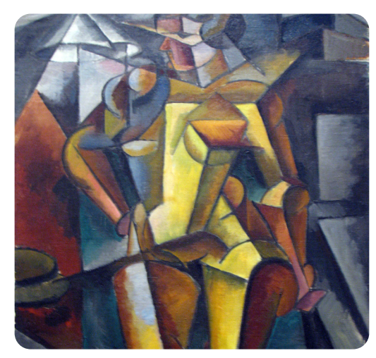
The Model by Lyubov Popova, 1913