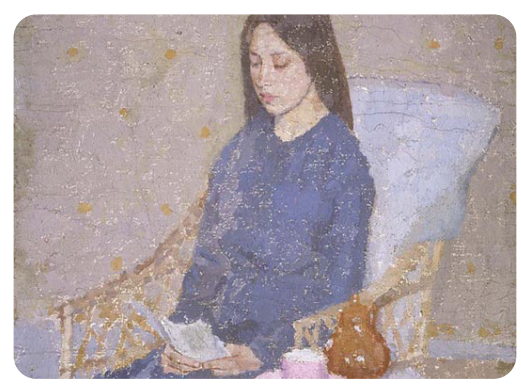
The Convalescent by Gwen John, c1923

The artist's interest in the human form has endured for thousands of years. Representations of human figures have been discovered from prehistoric cave paintings right through history until the present day. These figures can inform us about the cultural, religious or everyday life of different societies. Pictures of human figures can be figurative, abstract or photographed.