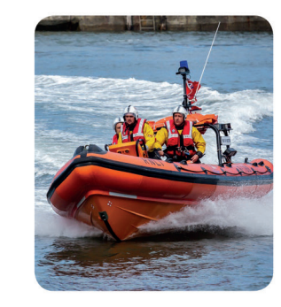
Call 999 in an emergency. Ask for the coastguard and they will call for the lifeboat.