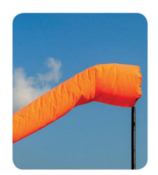
Do not use inflatable toys or airbeds in the sea when a wind sock is blowing.