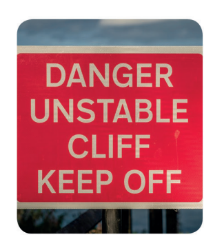
Look for warning signs, follow advice and do not take risks.

The coastline can be a dangerous place. It is important to stay safe and know what to do in an emergency.