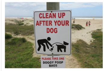
'Clean up after your dog' sign