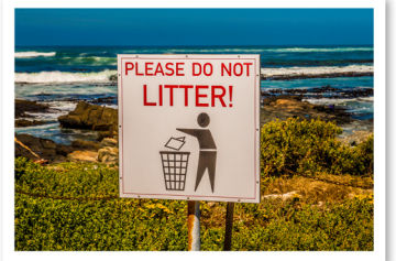
'No littering' sign

A community is made up of the people who live there. People in a community may have some similarities and differences but all people should be treated with kindness, compassion and respect. It is also important to look after the environment in a community. Removing litter and planting new bulbs are great ways to keep the community a nice place to live.