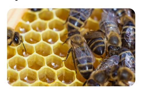
honey from bees