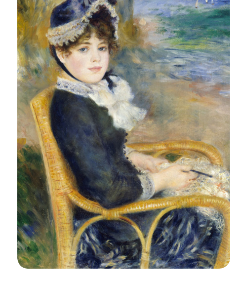
The textures of these two portraits are similar but the colours are different.