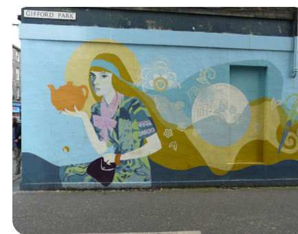
The Gifford Park mural by Kate George, 2015

A mural is a large picture that is usually painted onto a wall, ceiling or other structure.