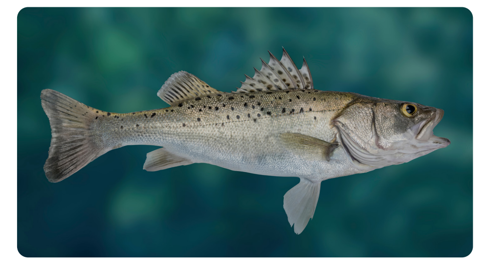
Fish use gills to breathe. They use their tails to swim and have fins to keep them upright.