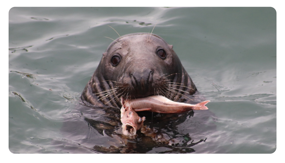
Carnivores eat other animals. Herbivores eat plants. Omnivores eat plants and other animals.