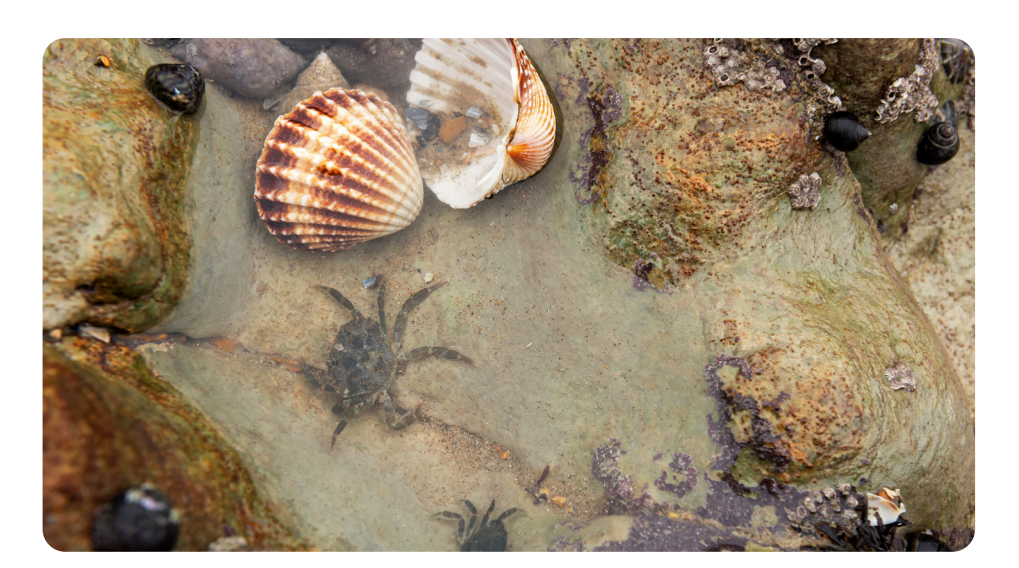
Rock pools are shallow pools of seawater on the rocky part of the seashore. Some only appear at low tide. They are habitats for many animals, such as starfish and crabs.