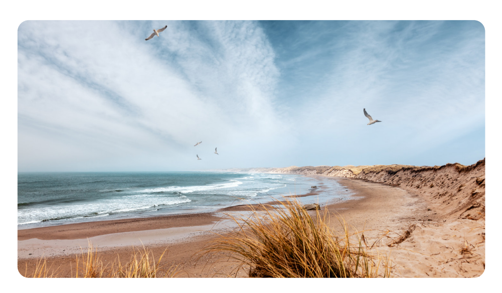
The seashore is the land along the sea or ocean. A beach is an area of sandy, pebbly or rocky land that is usually by the sea.

Read these interesting facts about the beach with a parent, carer or teacher.