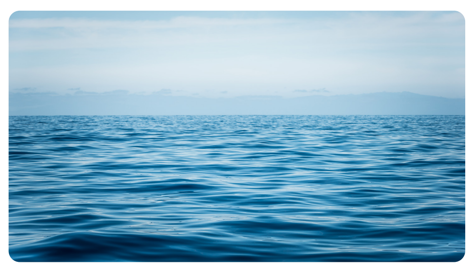
The ocean is a body of salt water that covers over two thirds of the surface of the Earth. The largest ocean is the Pacific Ocean.