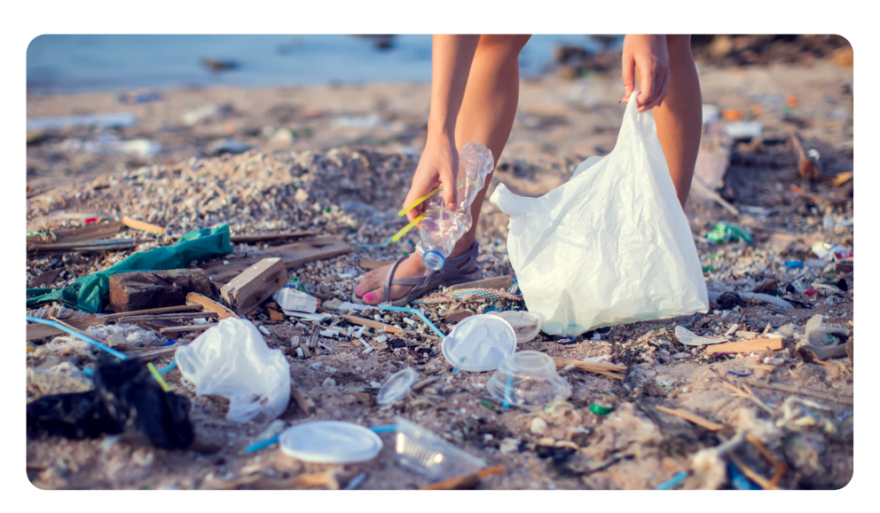
Leaving litter on beaches can harm and even kill the animals that live in the sea or on the seashore.