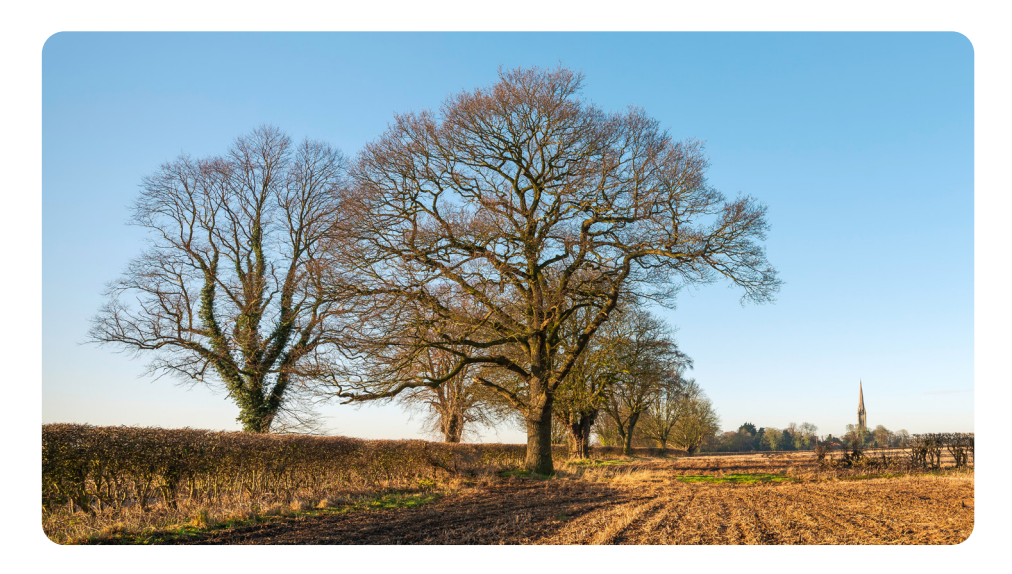
Lots of trees have no leaves in winter and not many plants can grow.