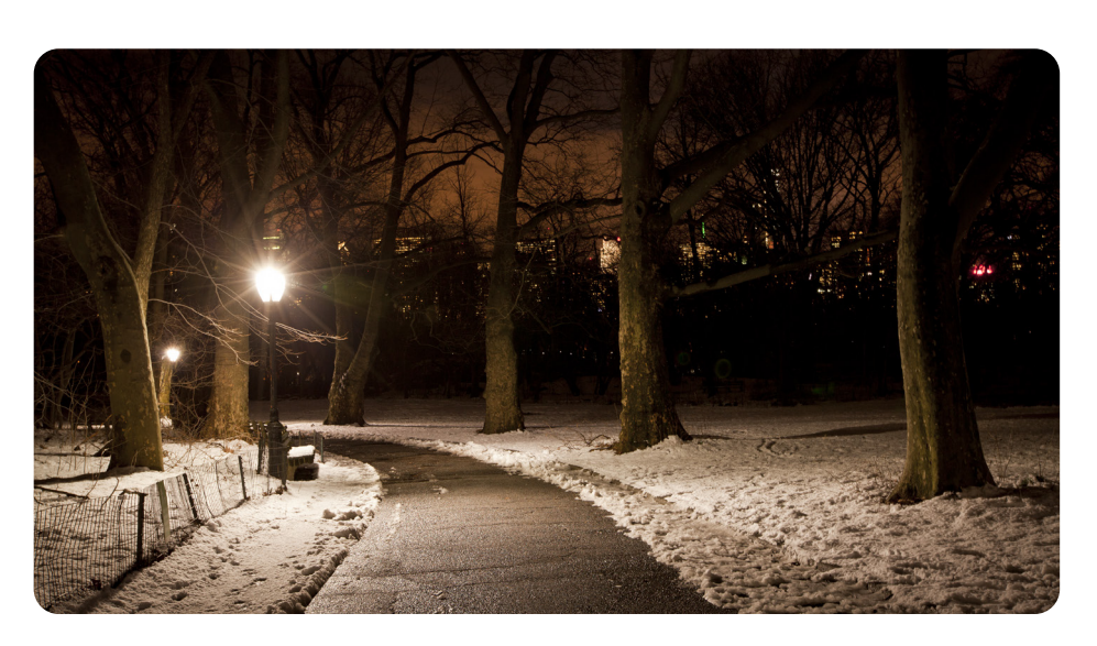
Winter is one of the seasons. In winter, the days are short and the nights are long.