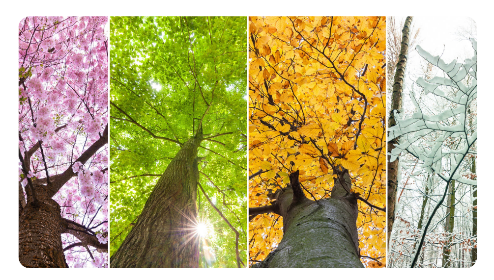
There are four seasons. They are spring, summer, autumn and winter.

Read these interesting facts about winter with a parent, carer or teacher.