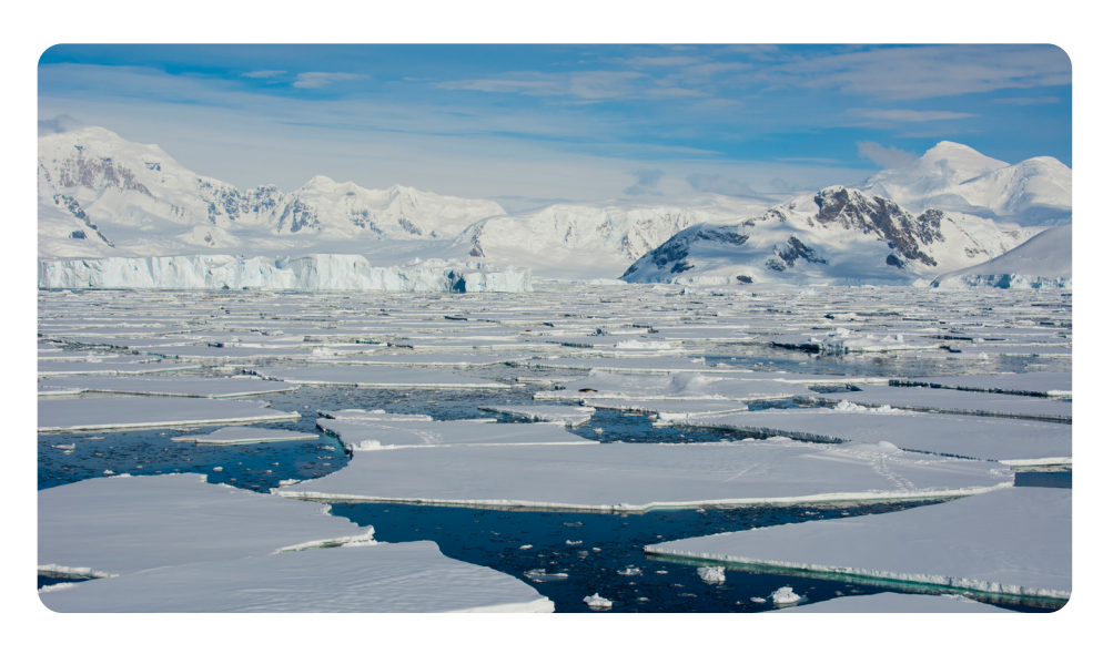
Some places are cold and snowy all year round like the Arctic and the Antarctic.