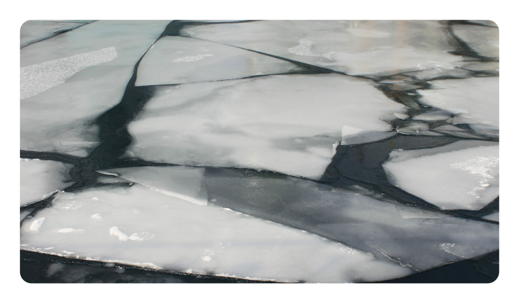
The weather can be very cold in winter and water in puddles and ponds can freeze into ice.