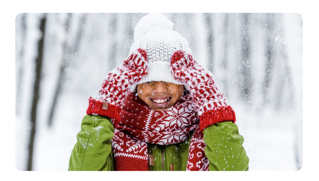
Sometimes it snows in winter.