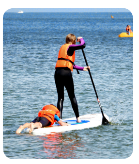
Use safety equipment, such as a life jacket.