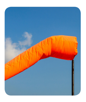
Do not use inflatable toys or airbeds in the sea when a wind sock is blowing.