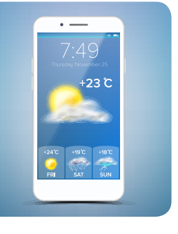
Check the weather forecast for bad weather.