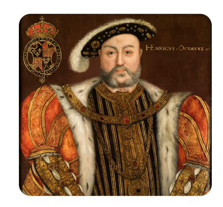
Henry VIII was the king who formed the Church of England.