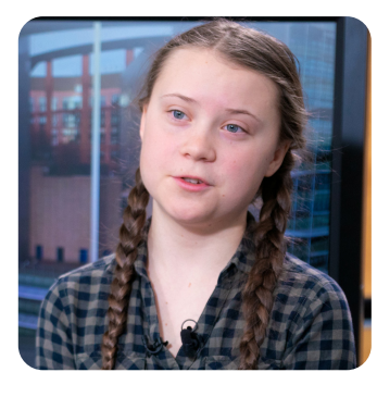
Greta Thunberg campaigns to stop climate change.