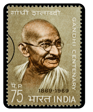
Stamp of Mahatma Gandhi