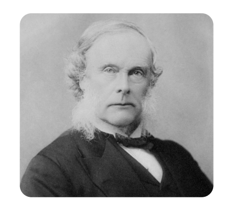
Joseph Lister found out that dirty conditions in hospitals caused infections.