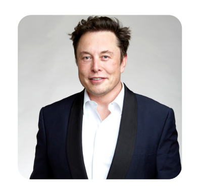
Elon Musk is trying to make a rocket to go to Mars.