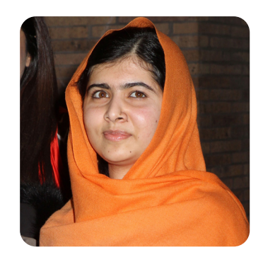
Malala Yousafzai campaigns for girls to have the right to go to school.

Significant people are still making big changes in the world today.