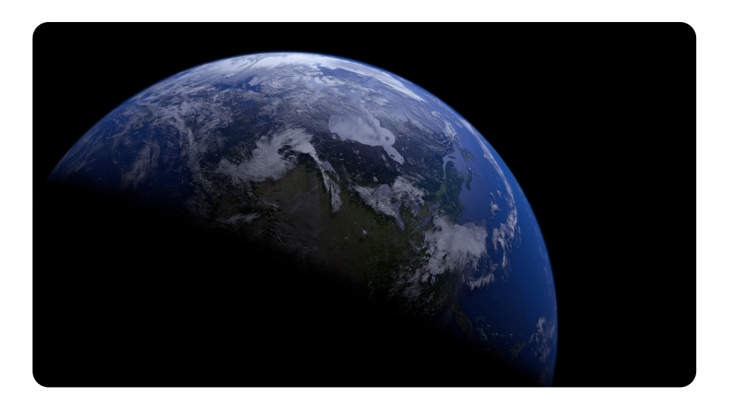
We live on a planet called Earth. It gets dark at night because our part of Earth is facing away from the Sun.