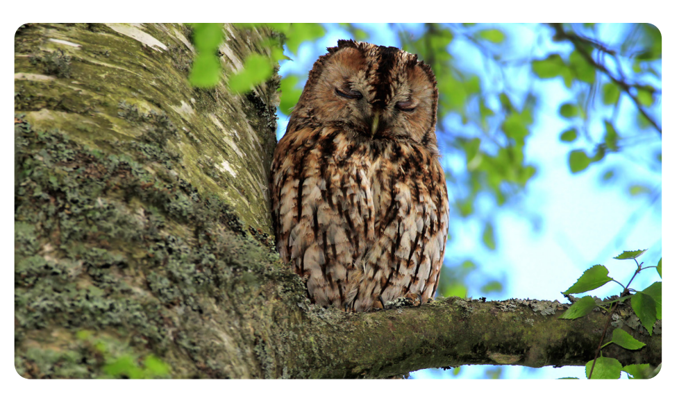
Some animals sleep in the day and are awake at night. They are known as nocturnal animals.