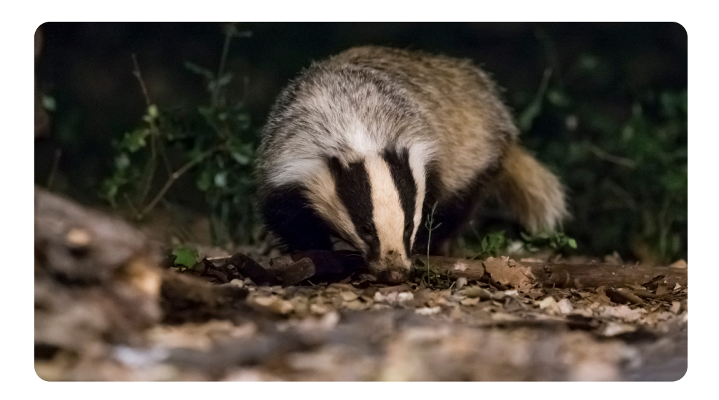
Bats, owls, foxes and badgers are nocturnal animals.