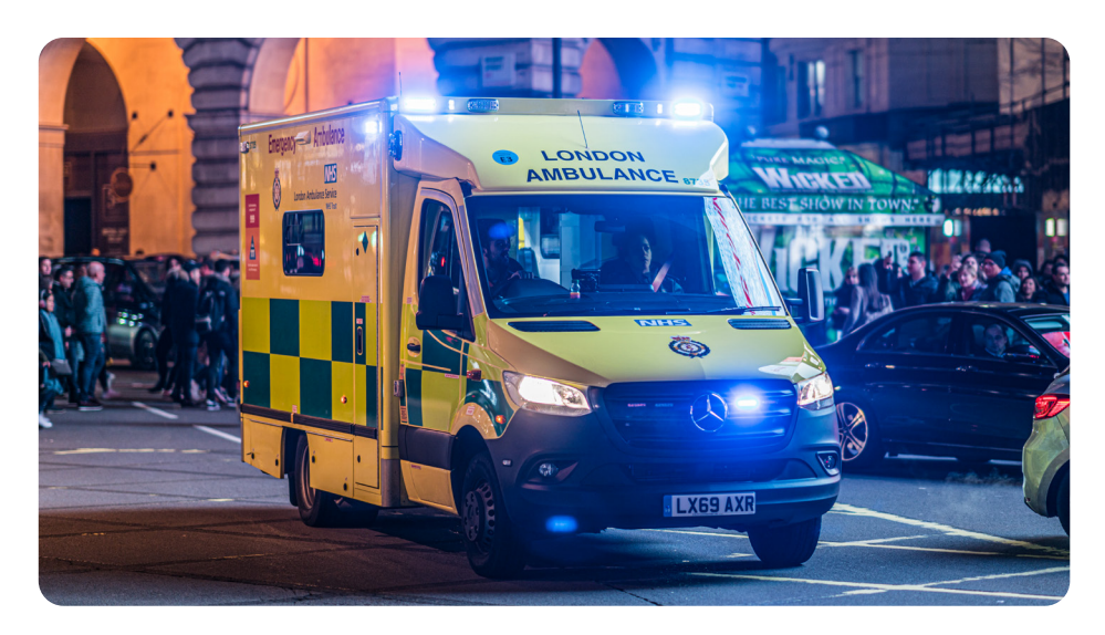
Some people work at night, like members of the emergency services.